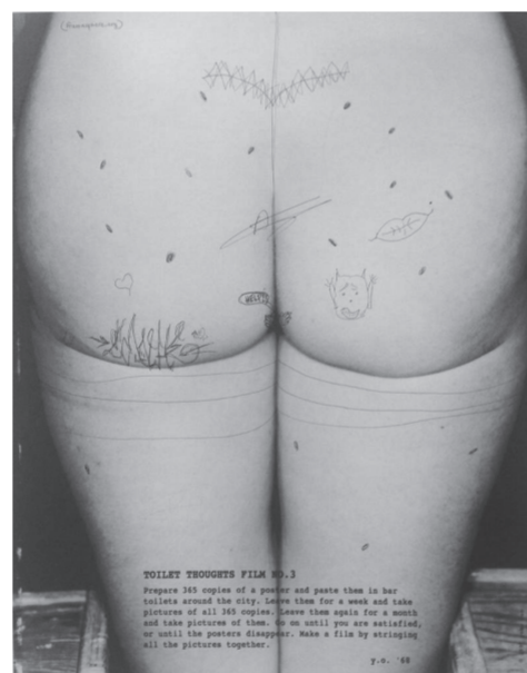
Yoko Ono, Toilet Thoughts – Film No. 3 , 1968/2019 © Yoko Ono

Posted at different stages throughout the year, Toilet Thoughts – Film No. 3 (1968/2019) is an instruction for a conceptual film, which involves putting a poster in toilets across various sites of a city, and periodically filming the posters.