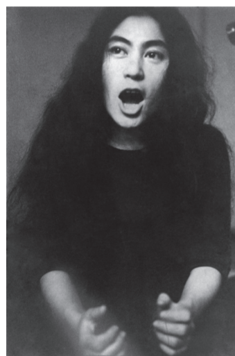
Yoko Ono performing Voice Piece for Soprano, 1961.

Showcasing Yoko Ono's work in the city of Cambridge for the first time ever, the exhibition YOKO ONO: LOOKING FOR... celebrates the 50th Anniversary of Ono's first visit to Cambridge and her debut public concert with John Lennon at Cambridge University's Lady Mitchell Hall on 2 March 1969.