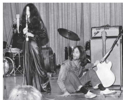
Yoko Ono and John Lennon at Lady Mitchell Hall, Cambridge, 2 March 2019.

To commemorate Yoko Ono and John Lennon's debut public concert at Cambridge University's Lady Mitchell Hall on 2 March 1969, the live recording of the concert Cambridge 1969 is available for visitors to listen to until the end of the year, whilst a historic plaque preserves a hidden gem of Cambridge's social history for future generations to come.