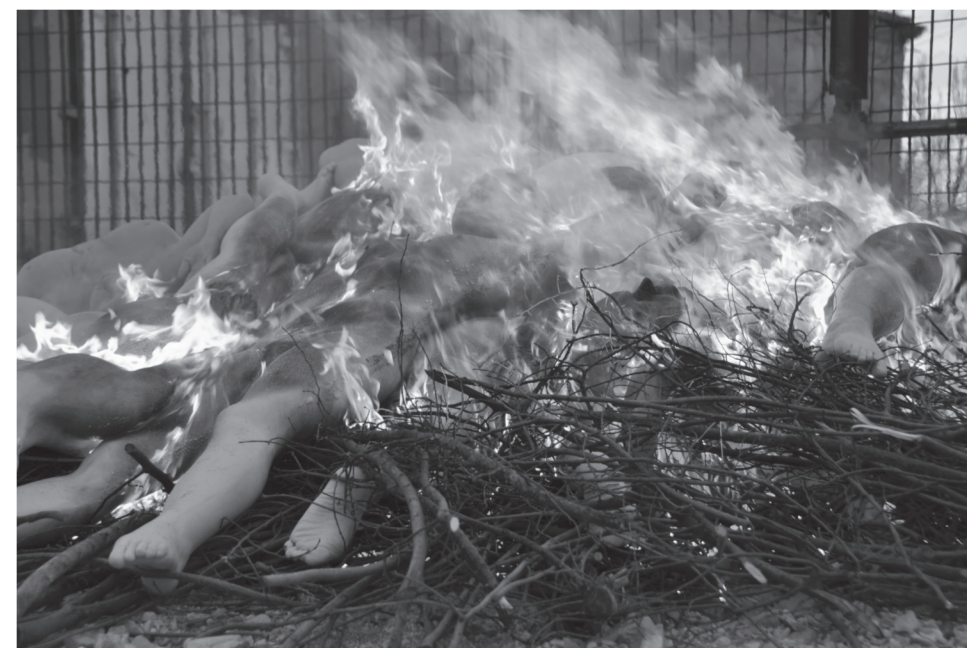
Yoko Ono, ARISING (2003) , film still, 2013 © Yoko Ono

8pm Gig by the Japanese four-piece noise rock and alternative rock band BO NINGEN