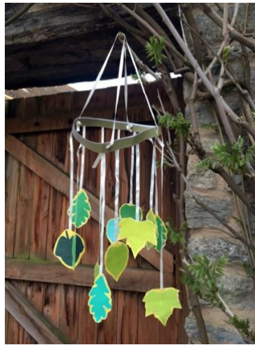
Tasty Leaf Mobile