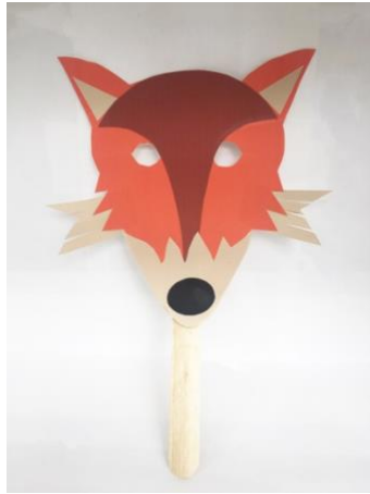
Make a fox mask